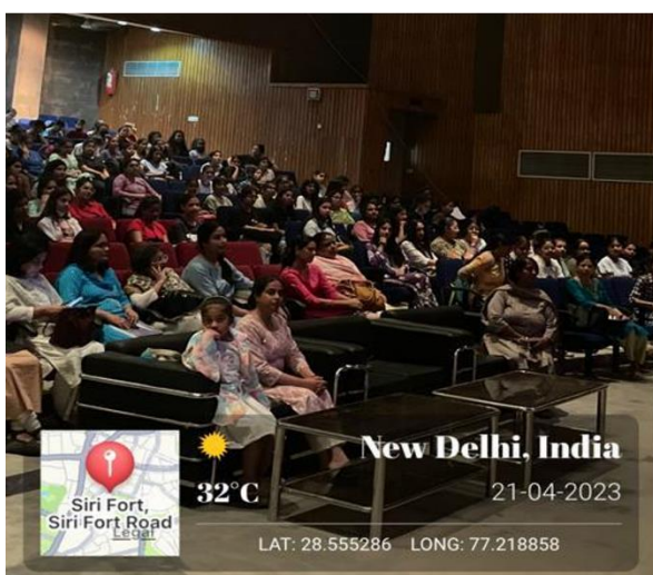
Exit Meeting with III year students