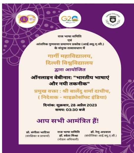
Bhartiya Bhashaye aur nayi takneek