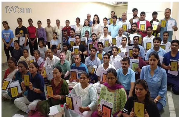
Five day Workshop for Non Academic Staff