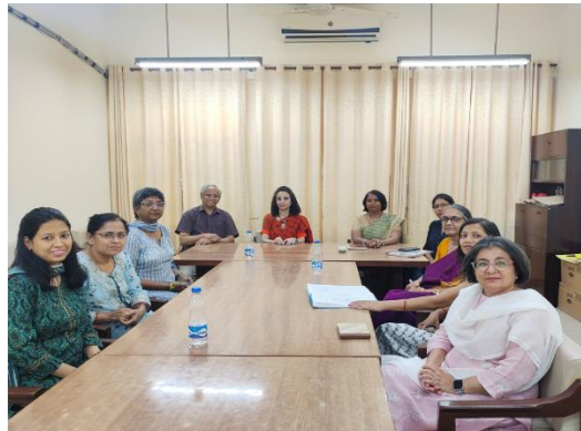
IQAC Meeting with external members